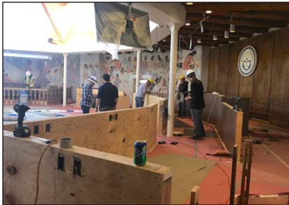
Photo: A quick look at workers from Keyah Construction, Inc. doing renovation work inside the Council Chamber.

The Navajo Nation Historic Preservation Department has been actively involved to ensure the property maintains the highest degree of integrity to meet the criteria established through the National Historic Landmark requirements.