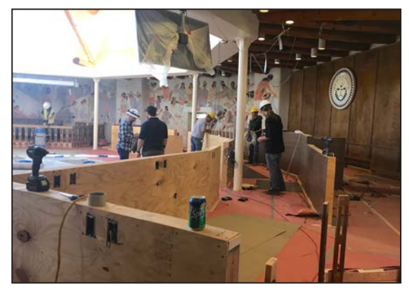
Photo: A quick look at workers from Keyah Construction, Inc. doing renovation work inside the Council Chamber.

The Navajo Nation Historic Preservation Department has been actively involved to ensure the property maintains the highest degree of integrity to meet the criteria established through the National Historic Landmark requirements.