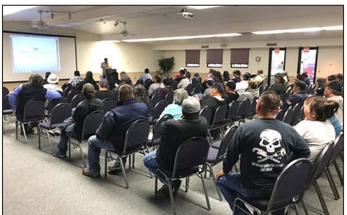
Photo: NGS employees were provided a presentation session by the Office of the Speaker to update workers regarding NGS's lease with the Navajo Nation on April 5, 2017.