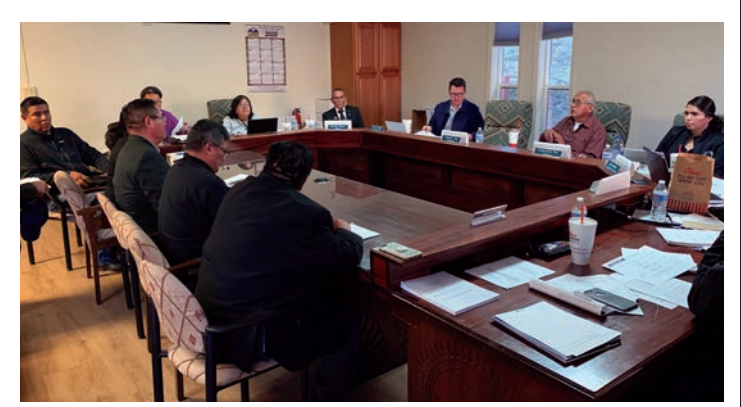
The Health and Human Services Committee worked with DODE and OPVP for the confirmation of new members to the Navajo Nation Board of Education. The positions were vacant for more than 10 years.