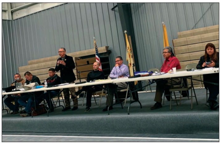
Chairman Rickie Nez of the Resources and Development Committee addressed Navajo allottees at Nageezi Chapter during a special meeting.

On April 14, the U.S. House Subcommittee on Energy and Mineral Resources conducted a field hearing at Chaco Canyon to learn about the impacts of oil and gas production. Discussions focused on creation of a 10-mile buffer zone around the park after infrared camera footage showed methane gas leaks. The meeting was considered government-to-