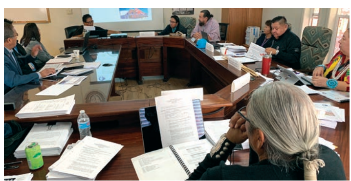
The Budget and Finance Committee discussed bonding for Navajo Division of Transportation projects on the Navajo Nation Dec. 3. The committee discussed needed stimulus component, projects from the 24th Navajo Nation Council and preparation for presentations before B&F Committee.