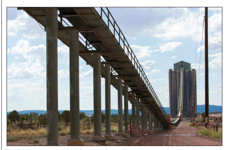
The Peabody Western Coal Company $4.5 million settlement fund is going to used for Phase II of the Many Mules Water Project. BMRB anticipates construction to start soon once the funding is received.