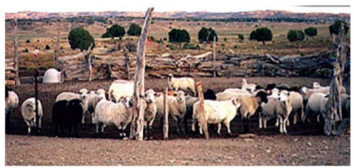
Sheep units are a primary concern of Navajos living in Navajo Partitioned Land. Legislation will be introduced to resolve the existing 10-sheep limit that residents are unhappy with.