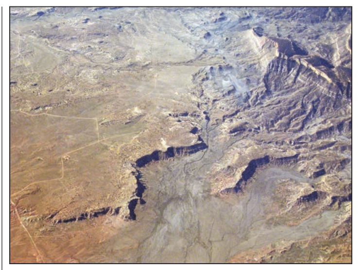
Aerial view of Black Mesa region, also known as Big Mountain. Courtesy photo by Doc Searls, circa 2008.

BMRB continues to meet with the Office of the Speaker to provide updates on the Many Mules Waterline Project related to Phase 2 and 3 funding requirements. Quarterly reports have been submitted to Office of the Speaker.