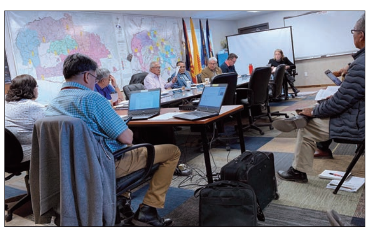
The Health, Education and Human Services Committee work session on school board apportionment brought out educators, administrators, community members and school board officials from across the Nation.

The Nov. 19 Health, Education and Human Services Committee work session covered school board apportionment, tribal scholarship endowment plan, and higher education fund. The work session included the Dept. of Diné Education, Office of Diné Accountability and Compliance, and Navajo Election Administration.