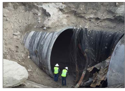
Photo: Workers inspect the siphon breach at Kuts Lift Station on NIIP property near Hwy. 550.

In addition, NAPI was informed that the Bureau of Indian Affairs (BIA) Regional Office had received $1.07 million to fund the siphon repairs. These funds have been reimbursed to NAPI.