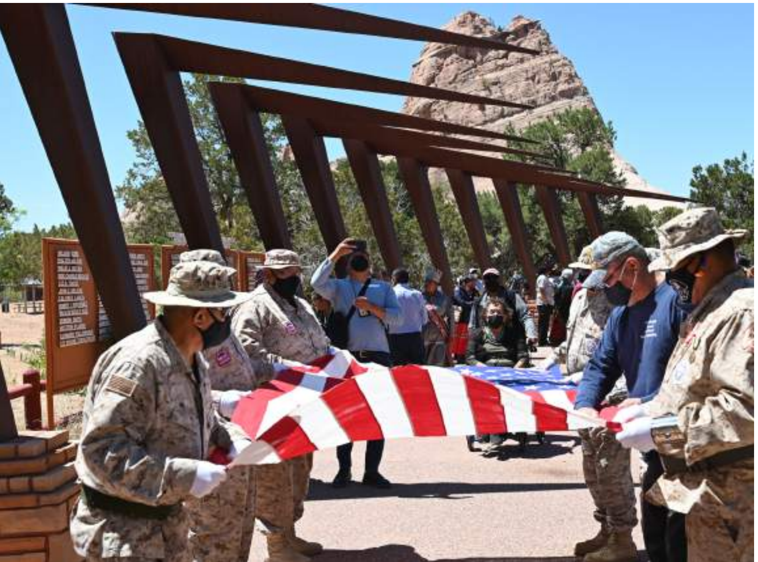
New Mexico Department of Veterans Services refold a United States flag during the Memorial Day Remembrance Ceremony (Below).