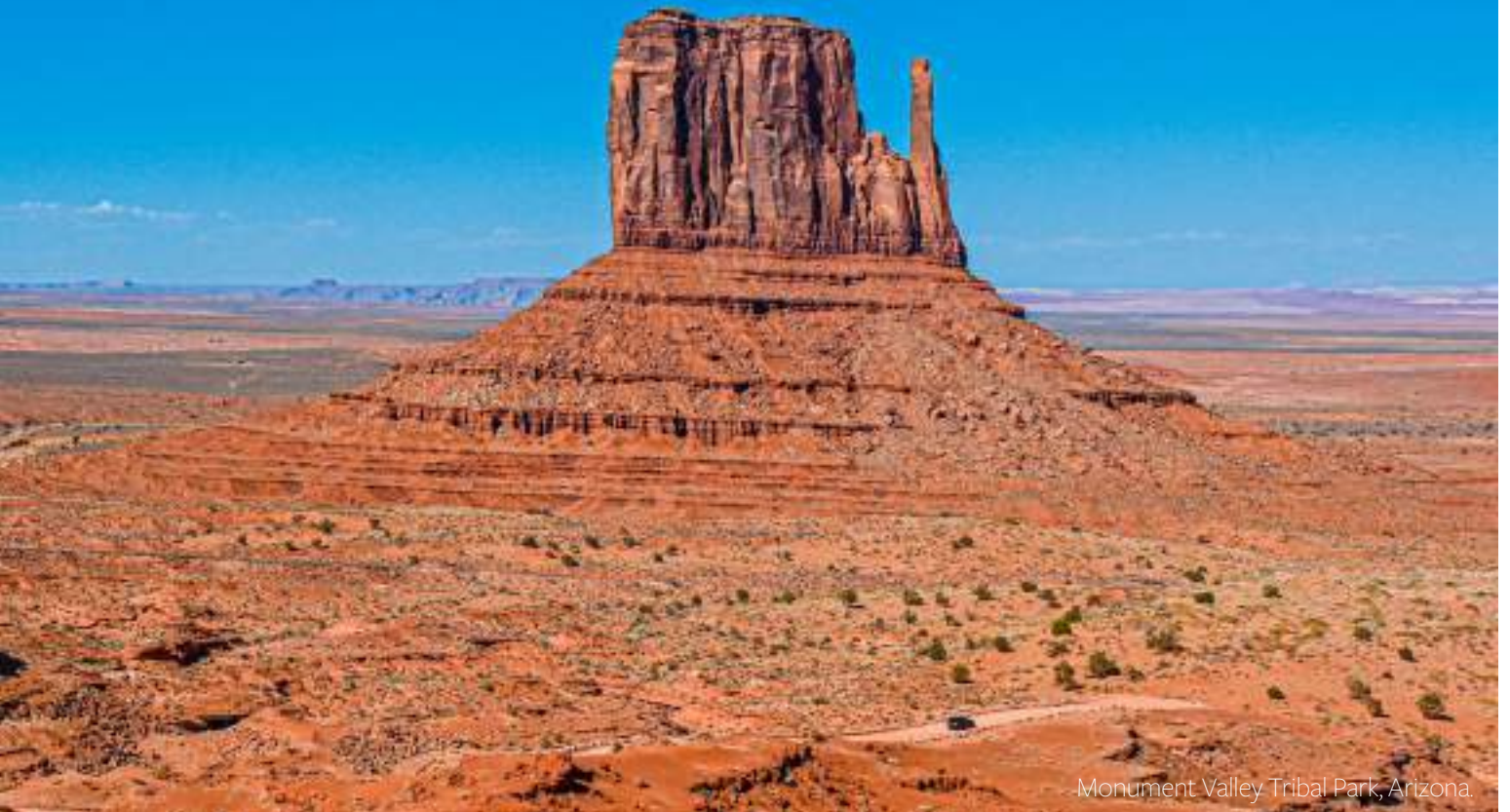
Monument Valley Tribal Park, Arizona.