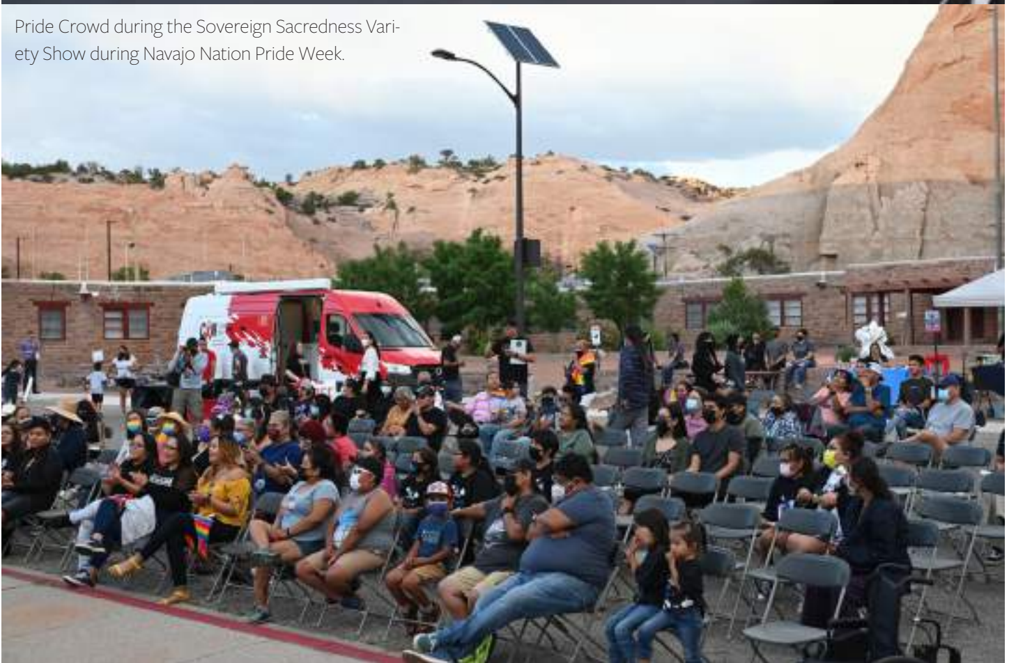
Pride Crowd during the Sovereign Sacredness Variety Show during Navajo Nation Pride Week.