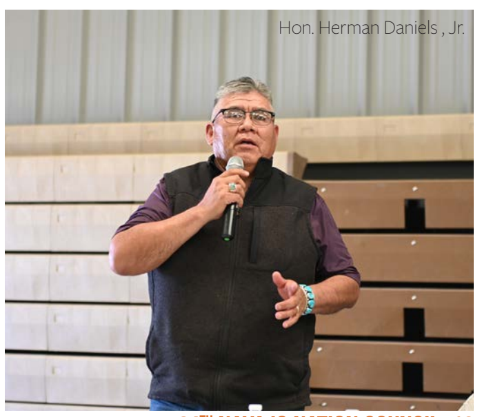
24TH NAVAJO NATION COUNCIL 19

The Navajo Utah Commission and the Naatsis'Aan Chapter in particular are becoming increasingly concerned due to the long delay in the Navajo Nation's right-of-way acquisition process. The Universal Service Fund Administration under the FCC and the Utah Legislature are funding the broadband expansion project for schools and medical facilities on the Navajo Nation in San Juan County. The fiber optic expansion activities have been completed in Montezuma Creek and currently finishing up in Monument Valley. Continuation and expansion into Navajo Mountain requires another right-of-way permit. A cultural report completed by Emery Telcom and their associates have been awaiting review and approval at the Navajo Historic Preservation Office for some time. The participation of Navajo Historic Preservation is necessary to complete the right-ofway process for this important project. The project is currently facing timeline challenges stipulated by funding sources contributing to this project. The Navajo Utah Commission is recommending the Navajo Nation Council to consider streamlining the right-ofway process which often impedes urgently needed projects.