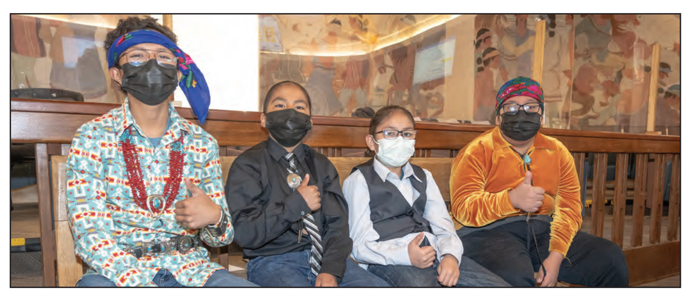
Students from Diné Bi Ołta' provide the National Anthem and Pledge of Allegiance during the first day of the 25th Navajo Nation Spring Council Sessions.

Internally, we also will seek the Council's support for a plan of operation for the Office of the Speaker to provide a foundation and guidance for the office and Legislative Branch. At the direction of Council members, legislative staff are also drafting policies and procedures to guide internal operations and clarify uncertainties in practices and procedures.