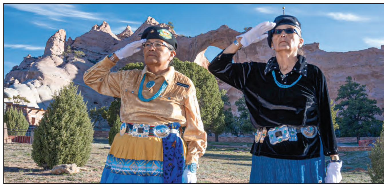
Diné Saani Silaołtsooi Color Guard, Navajo women warriors, posting the colors at the start of the 25th Navajo Nation Council Spring Session April 2023.

Under the 25th Navajo Nation Council, several work sessions and orientations were held to receive updates from the Navajo Nation Department of Justice and outside counsel