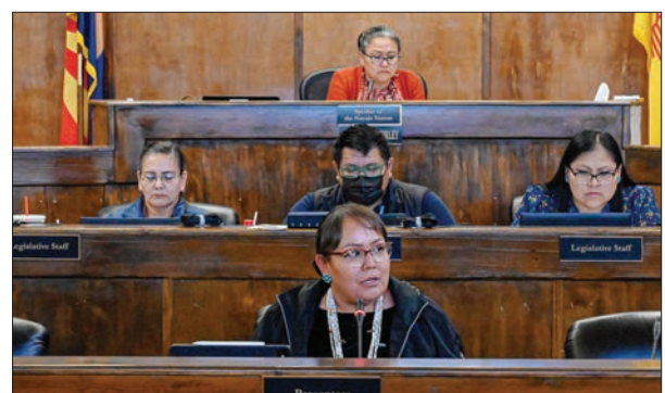
Speaker Curley and the 25th Navajo Nation Council have been addressing the FY2026 Comprehensive Budget.